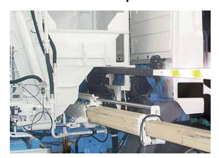
igus® readychain® used for GEORG disposal vehicle tested quality under tough conditions