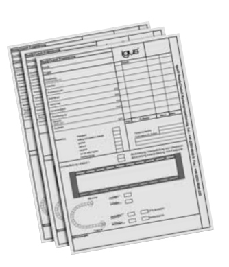
Planning with well thoughtout forms and software