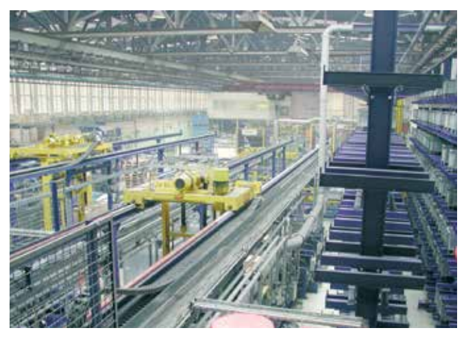
igus® readychain® used for terotechnology applications with different travels