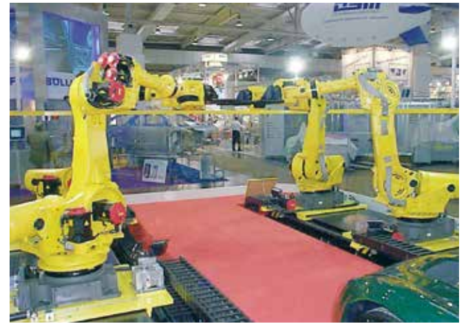
igus® readychain® used for travel axles for 6-axis robots